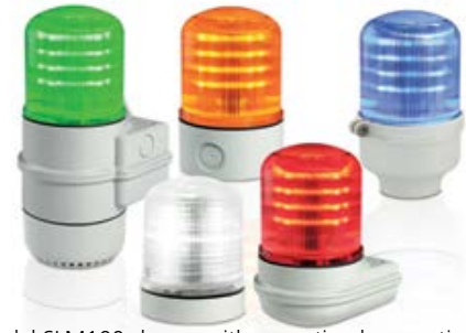
Model SLM100 shown with mounting base options (ordered separately)